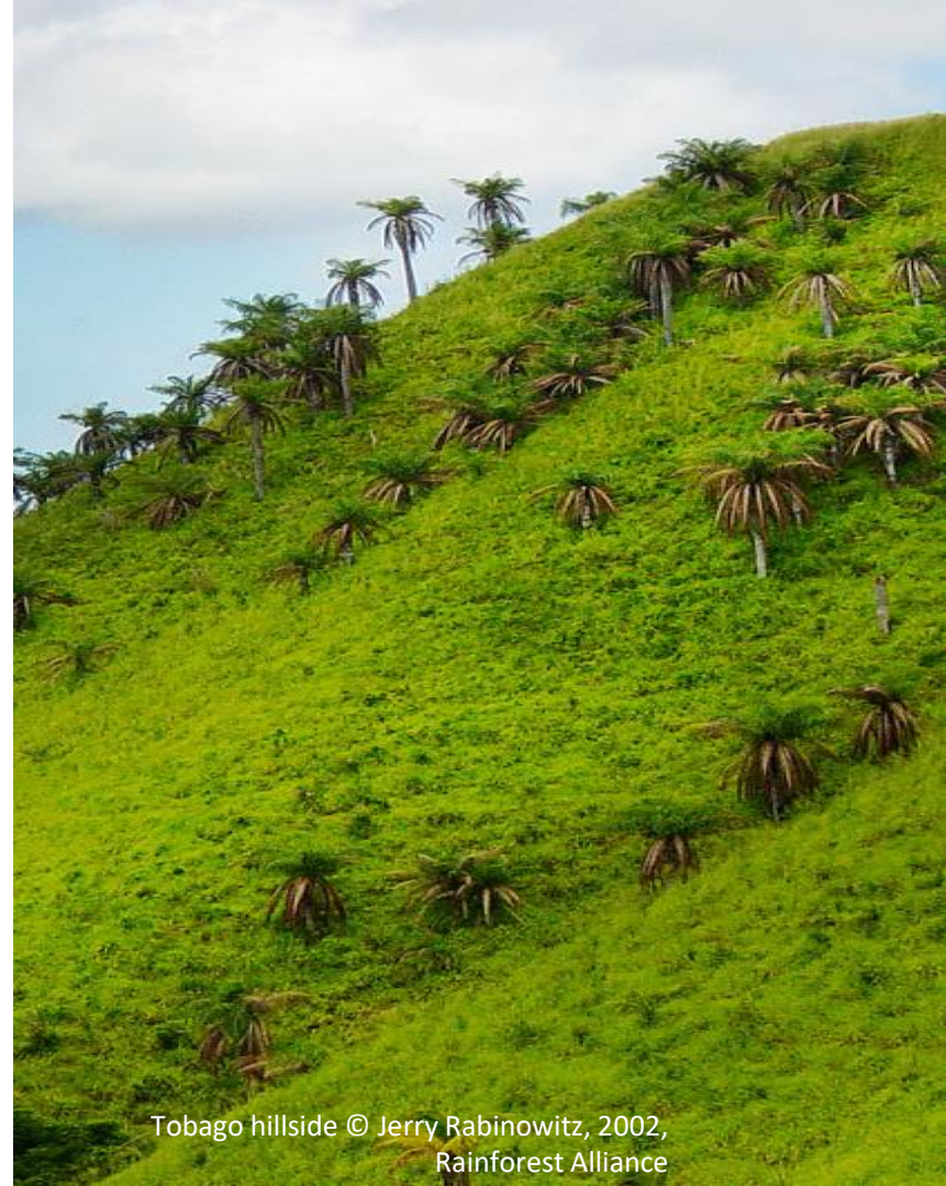
Tobago hillside