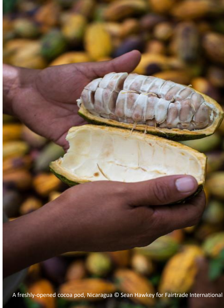
A freshly-opened cocoa pod, Nicaragua